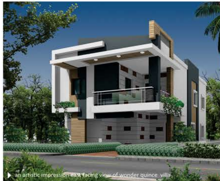
an artistic impression east facing view of wonder quince villa