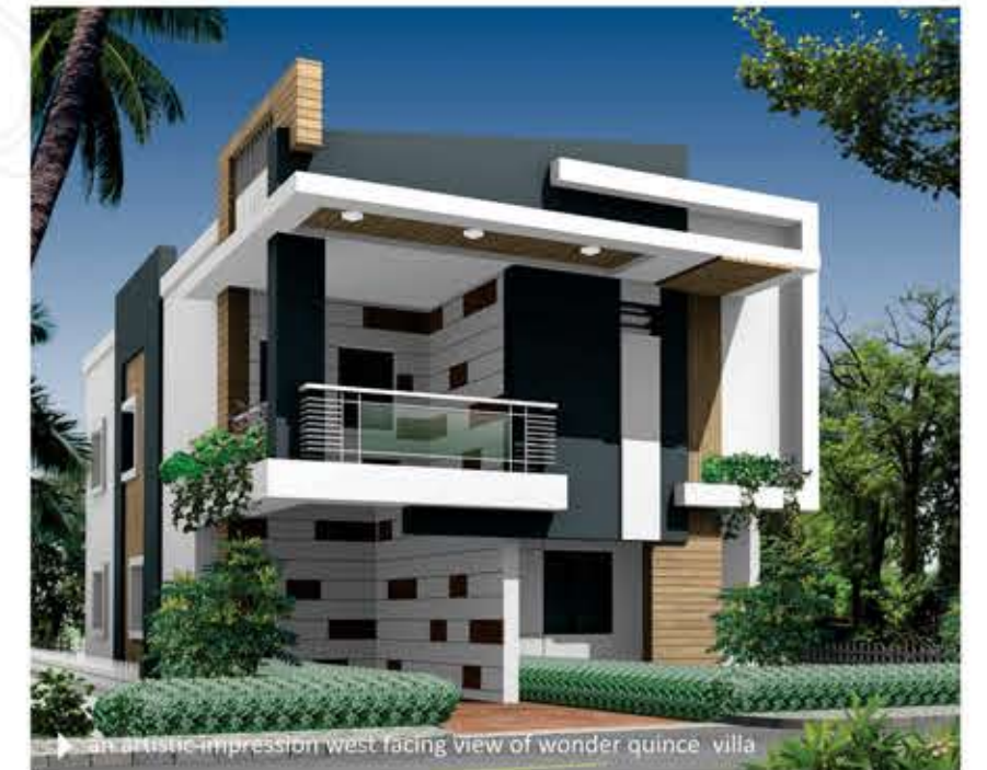
an artistic impression west facing view of wonder quince villa